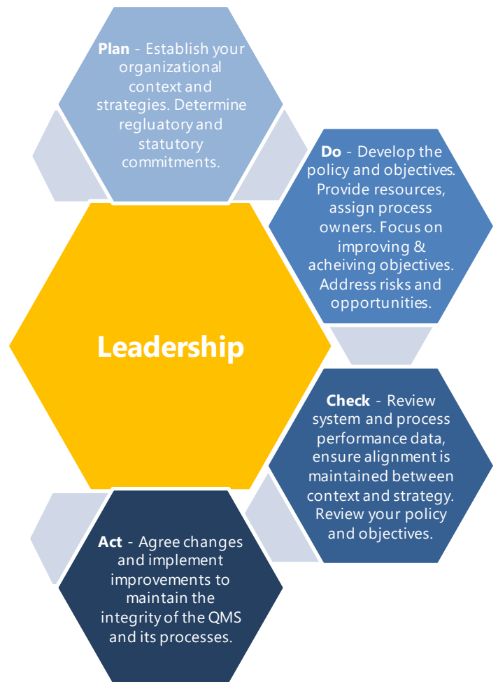
Figure 3: Leadership PDCA Cycle