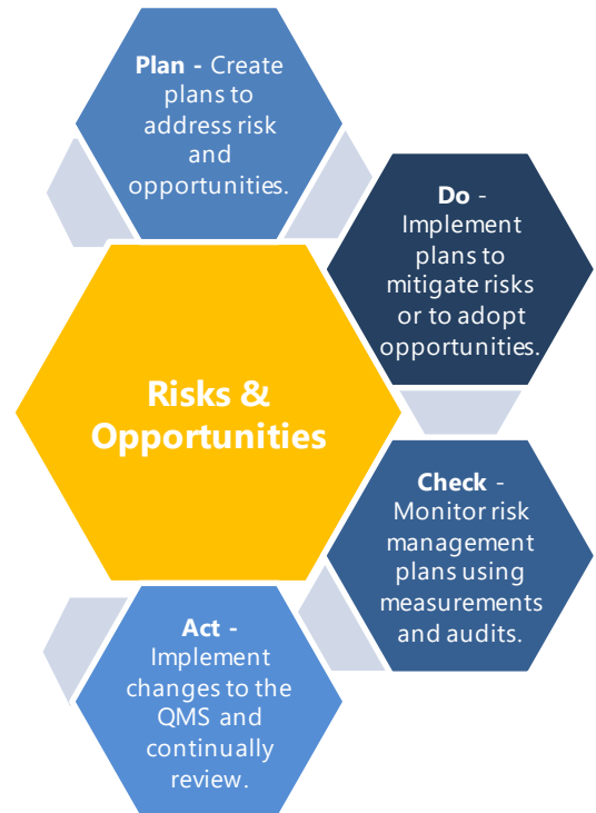
Figure 4: Risk & Opportunities PDCA Cycle