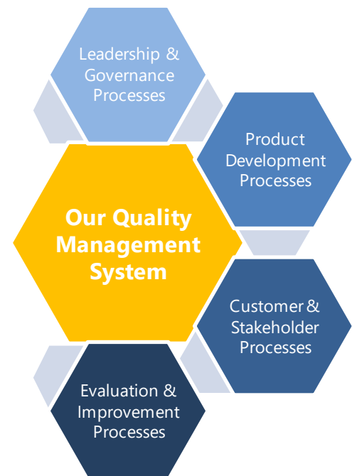
Figure 2 : Key Process Groups

We use Process Effectiveness Measurement Parameters that are linked to our objectives to control and monitor our processes, as well as assessments to determine the risks and opportunities inherent to each process. We use trends and indicators relating to nonconformities, objectives and corrective action, as well as, monitoring and measurement results, audit results and customer satisfaction data, process performance and the conformity of our products.